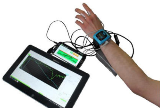
Figure 1. Technical equipment for data acquisition during monitoring of vital signs [6].

The focus is on the continuously measured vital signs - pulse, oxygen saturation, skin conductance and skin moisture. Fig. 1 shows how the technical equipment is attached to the participant.